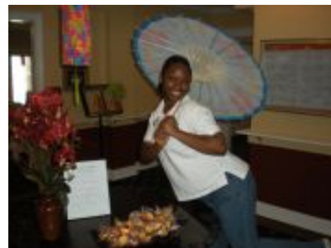
Korto gets into the Chinese-themed lunch!