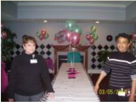
Hospice volunteers used their expertise to decorate for our Sock Hop party.